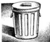
a large, covered trash container,

Here are six basics you should stock in your home: water, food, first aid supplies, clothing and bedding, tools and emergency supplies and special items. Keep the items that you would most likely need during an evacuation in an easy-to-carry container—suggested items are marked with an asterisk (*). Possible containers include