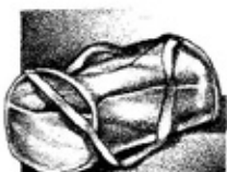
or a duffle bag.